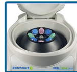
Optional 8-place rotor for 5ml tubes and 2ml cryovials

C2417 MC-24™ Microcentrifuge with 24 place COMBI-Rotor $2,666 C2417-R5 Optional 8 x 5ml rotor $1,128 C2417-R5-ADP2 2ml cryovial adapter for C2417-R5 rotor, 6/pk $140