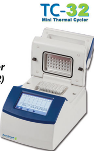
TC-32 Mini Thermal Cycler

T5000-96 TC 9639 Thermal Cycler, multi-format block $5,995 T5000-384 TC 9639 Thermal Cycler, 384 well block $6,979 T5005-3205 TC 32 Mini Thermal Cycler $3,775