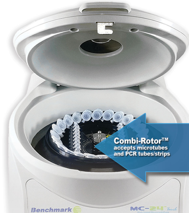
Combi-Rotor™ accepts microtubes and PCR tubes/strips

C2417 MC-24™ Microcentrifuge with 24 place COMBI-Rotor $2,666 C2417-R5 Optional 8 x 5ml rotor $1,128 C2417-R5-ADP2 2ml cryovial adapter for C2417-R5 rotor, 6/pk $140