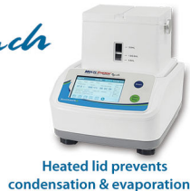
Heated lid prevents condensation & evaporation

Speed range: 200-3,000 rpm (block dependent) Shaker Orbit: 3mm Temp. range: Ambient -20° to 105°C