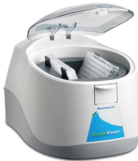
PLATE FUGE™ MICROPLATE MICROCENTRIFUGE