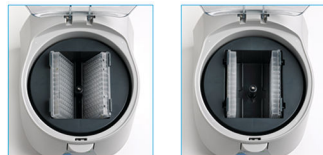
Before/After Centrifugation During Centrifugation

C2000 PlateFuge™ Microplate Microcentrifuge $894